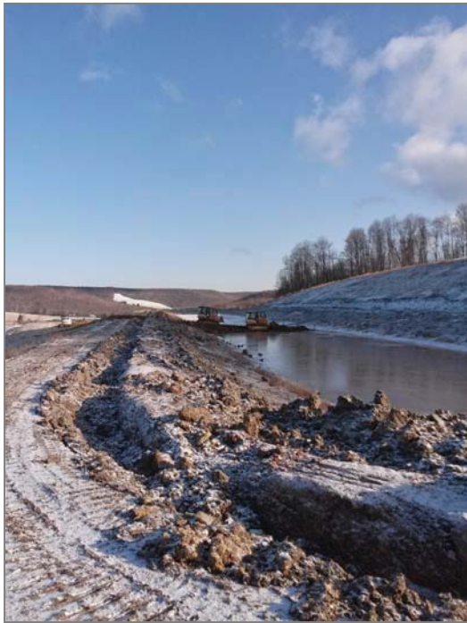
Photo 2 – Dividing the impoundment to help manage incoming water. All water had to be collected / recycled during the reclaim process.