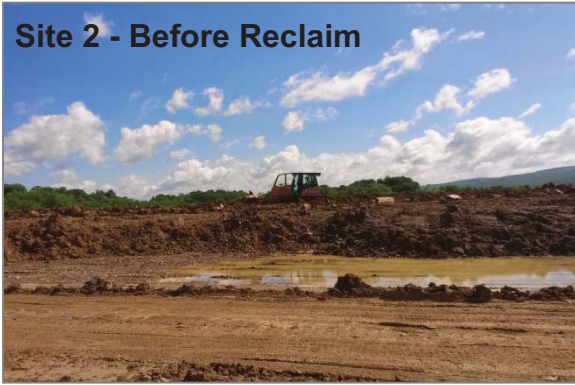
Site 2 - Before Reclaim