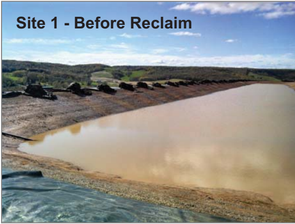
Photo 1 – Removing Liner. We had to deal with significant amounts of ground water during the reclaim process of this impoundment.