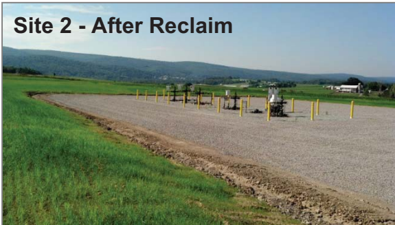
Site 2 - After Reclaim