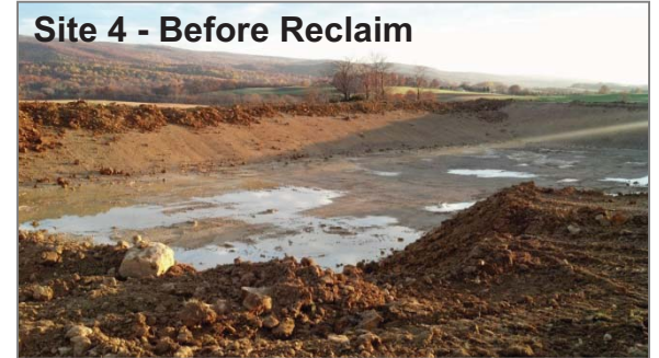
Site 4 - Before Reclaim