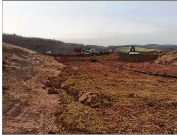
Photo 3 – Installing DEP approved field drainage system. We recommended a field drainage system be installed to prevent any future problems for the property owner due to the amount of ground water draining into the area.