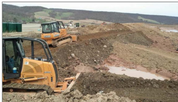
Photo 4 – This project consisted of moving approximately 25,000cy of earth.