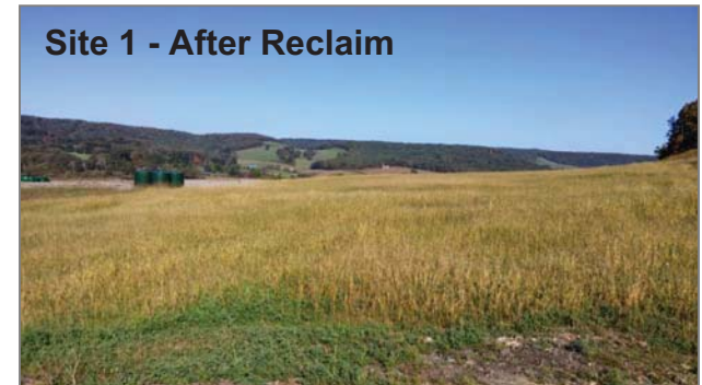
Photo 7 – Reclaimed impoundment. Standing at the same location as Photo 1.